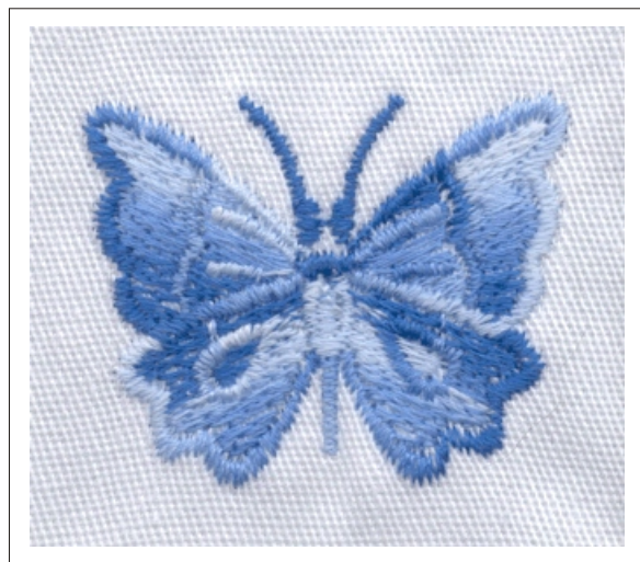
Sylko Multi - for ombre & multi-colour designs

Sylko Multi is a fine count mercerised cotton embroidery thread which has been space dyed in an attractive range of ombre and multi-colour shades